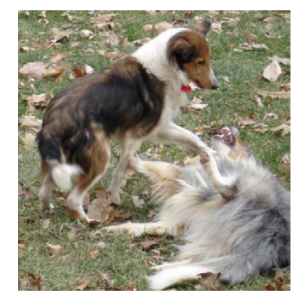
Zooey and Kyla mix it up