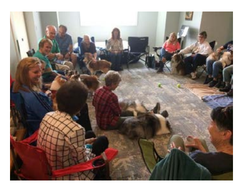
Volunteers learning about good dental care, May 2019