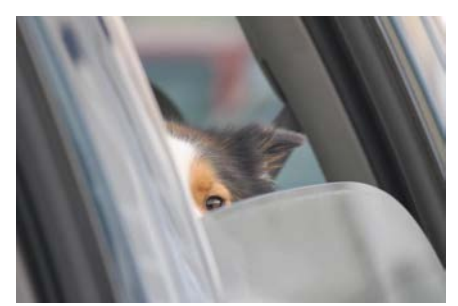
Off to a new home