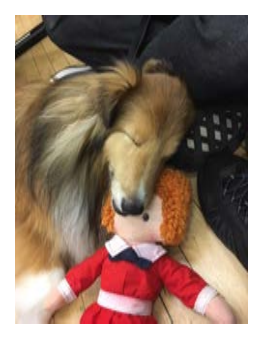
Show biz is very tiring!