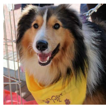
Hoping for a new home