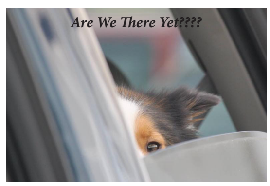
On the Road ... Since 1979 by Susan Bailey

- or any pet - can be lots of fun. But it takes preparation and planning to have the trip come off without negative experiences. Start small with short trips. If you have your own RV, spend a couple of days in it at home so your dog can get used to living in it. And, as always, be very careful to keep your dog secure when you travel. For example, highway rest areas are great for a quick potty break, but they can be very scary places for a Sheltie. Too may dogs have escaped in rest areas. Let's not think about that - just be VERY careful. And have fun!