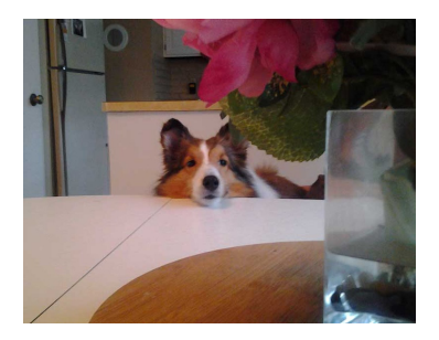
Summer Sheltie Treats You Might Like 'Em, Too!

Blend all together and freeze in 3 oz paper cups or ice cube trays. Microwave for a few seconds just before offering to your begging Sheltie.