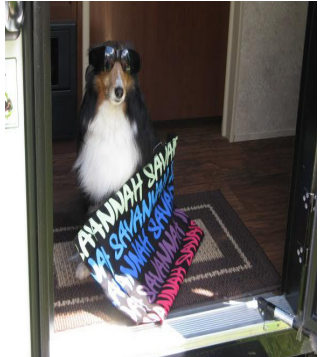
Calli visits Savannah

with your reservation) away from the obvious busy areas of the campground. If you wind up near party animals, you can try to move to a different site, but it may be difficult. Walk your dog around the area several times to familiarize her to the surroundings, noises, smells, and note where there might be things that are scary for your dog, like a noisy swimming pool or children's playground. Be sure to clean up after your dog - that goes without saying, doesn't it? If you leave your dog behind in the RV while you are sight-seeing, leave a note on the door in case