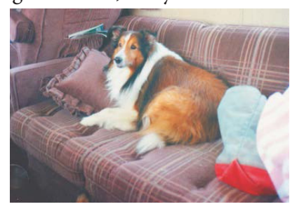
Robbie Says "Let's Go!"

Shore, the Outer Banks of North Carolina, Hilton Head, Lake Placid, Vermont, and Toronto (important note: rabies certificates required at th