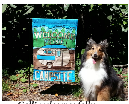
Calli welcomes folks to her campsite

Carol and Terry have a "fifth-wheel" trailer and a pick-up truck to tow it. They can leave the trailer in the campground and use the truck to drive to the things they want to see. Susan and Bill Bailey use self-contained motorhomes for their travels. For any recreational vehicle, consider the size of the dog (and number of dogs), get vinyl floors, and be sure to get air conditioning. You might leave the dog(s) in the RV when you're off seeing something, and you want him/her to be safe and comfortable. Of course, you will want to be comfortable, too.