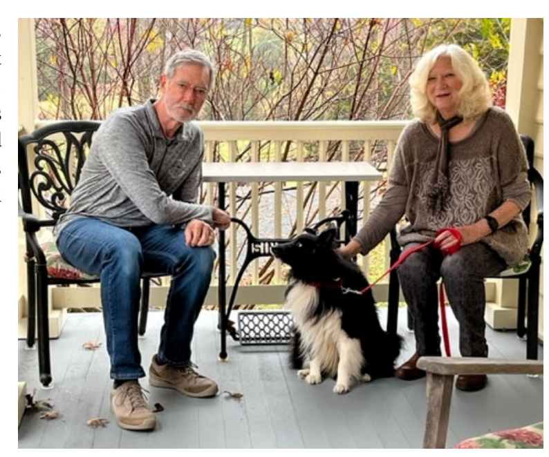
These are my new peeps, the fuzzy-faced one and the long-haired one