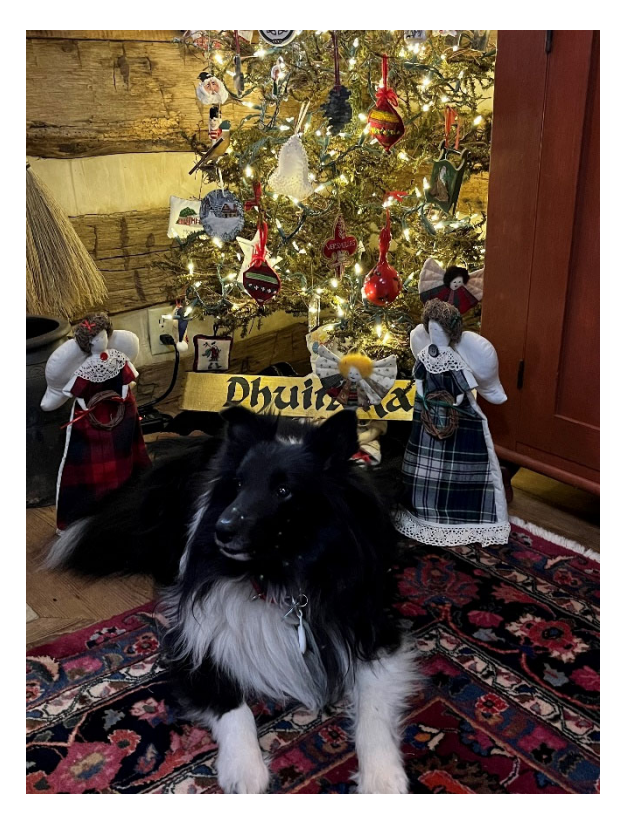
This is my first Christmas in my new home. How about those tartan angels?