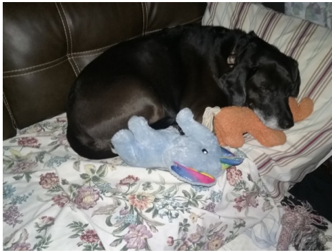
I love you Louie and I will keep your orange Ellie with me until later.