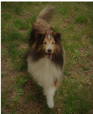
Louie, as you travel through your journey we give you our love. You brought us love, laughter, playfullness, and your charm. Until we're together again!!!