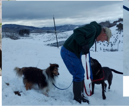
Dad there is a lot of snow! Burr it is cold and we are ready to play in the snow!!