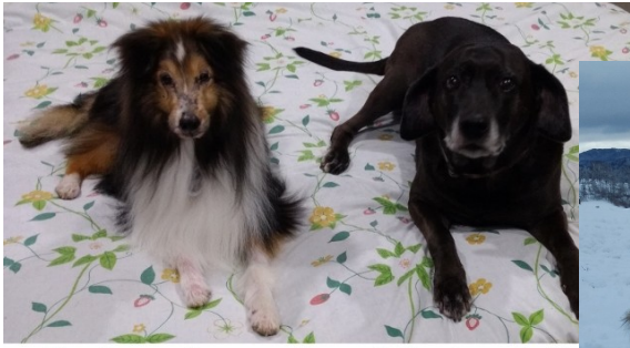
Morning vocals are over for now!! Time to go play!!!