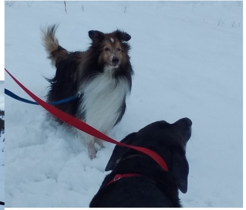
O'H BOY!! Fresh snow!! Off with our leashes