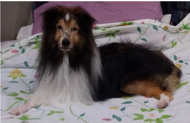
Good morning Louie, time to get up! Aww, can I have a few more minutes?