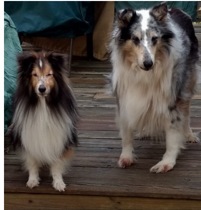
OK, we are both ready to go inside now. You should be ready too!