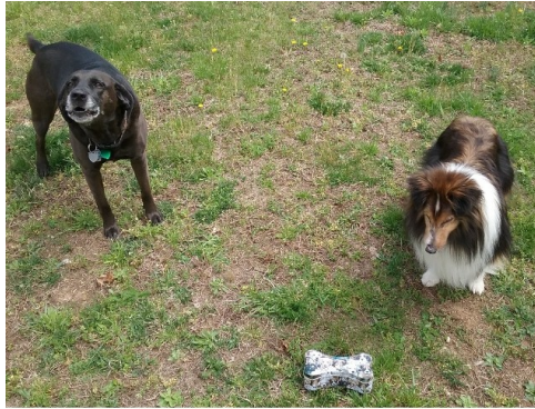
Whew!!! Mom we finished our walk, but you need to open the can with our treats because we have paws, not hands silly!