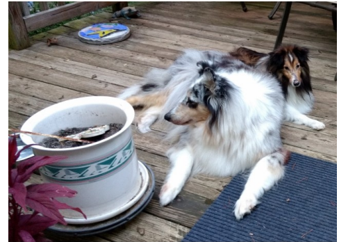
Hi Mom, I am resting on the deck with Skyla and watching you repot your plants.