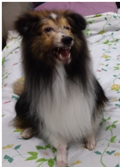
OK, OK, I am up now!!