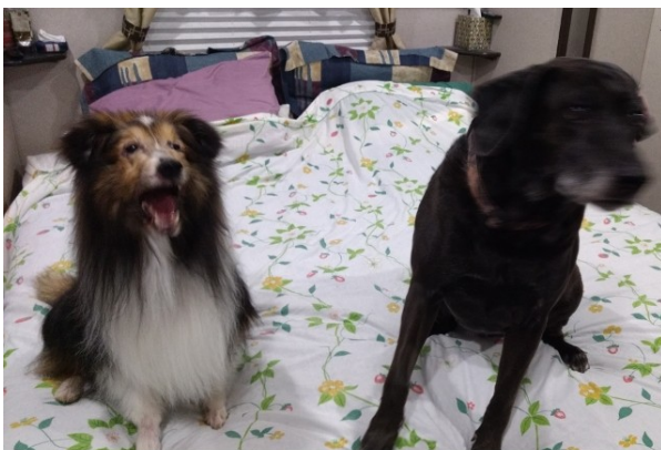
Louie is teaching Gabbee to sing in the morning!!!