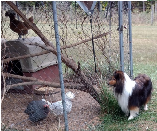
WOW...more new friends! Feathers everywhere!