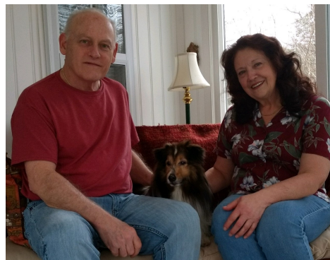
My new Mom and Dad