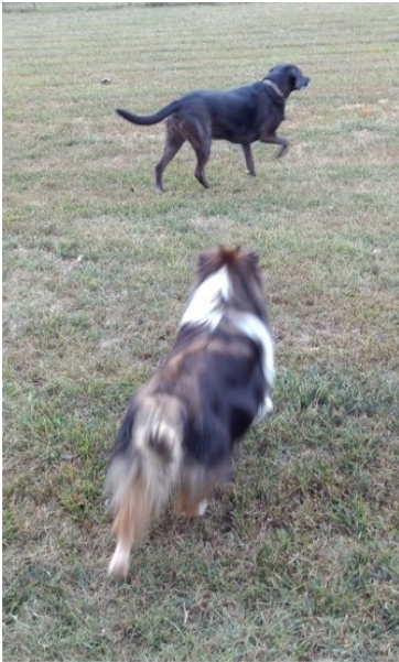
I'm coming Gabbee--Boy she's really fast!