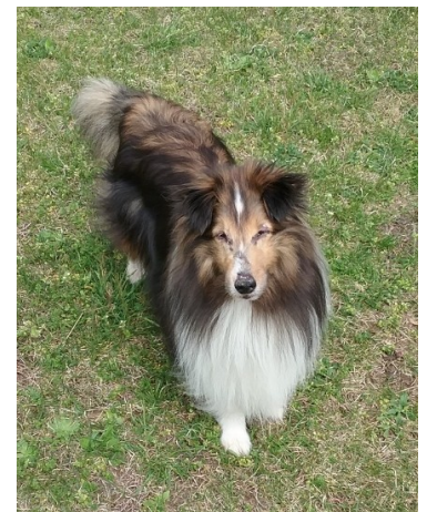
Just you and me Mom!!!