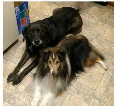
Snack before bedtime