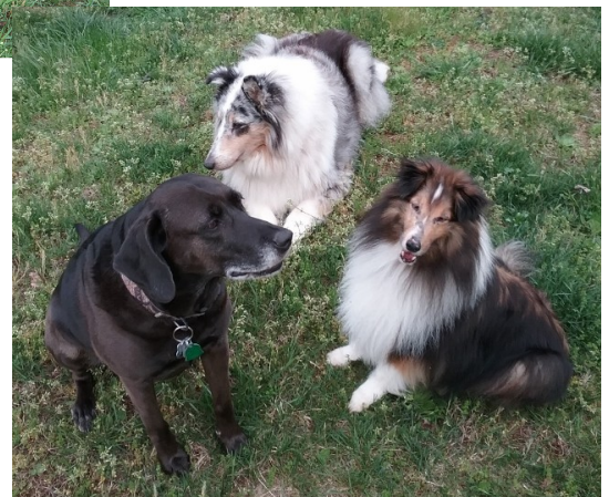
Handsome me with my two new girl friends!! Being the charmer that I am has great benefits like getting extra treats, hugs, and kisses from my new forever Mom!