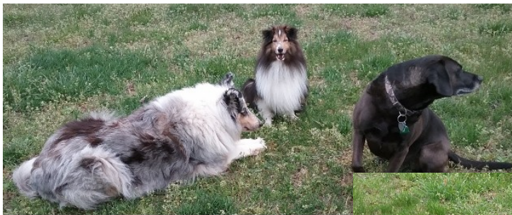
Break time on our walk