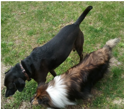
Woof, that was a good work out! Are you as tired as me?