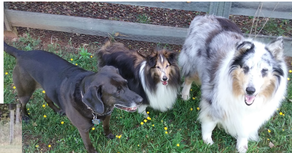
Just rounded the third corner of the field with Gabbee and Skyla and catching our breath!!