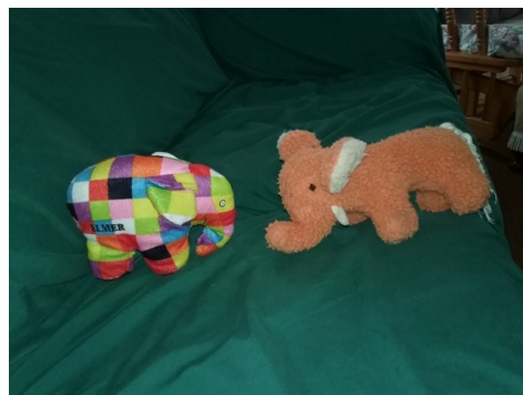
My two favorite Ellies - I came with the orange one and my forever parents had the patchwork one waiting for me!!