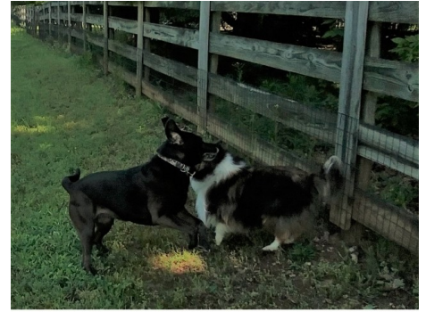
OK...we both win the morning run!